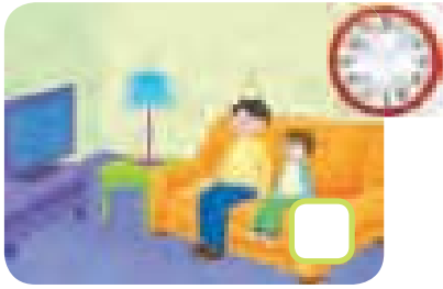
f watch TV