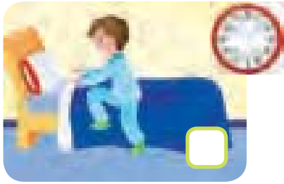
c go to bed